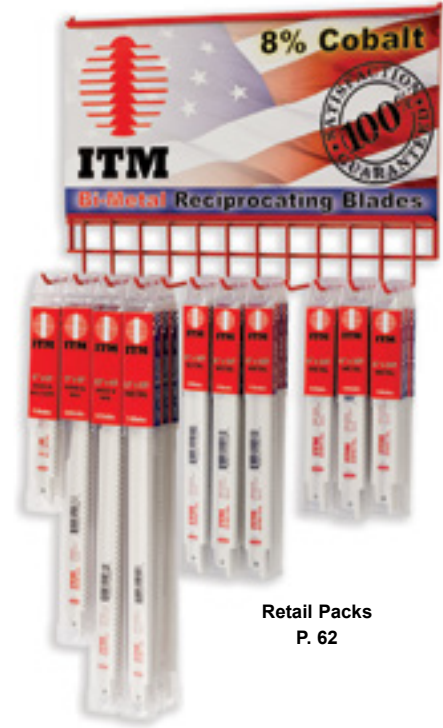
Retail Packs P. 62