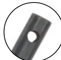
FISH HOLE ON SHANK