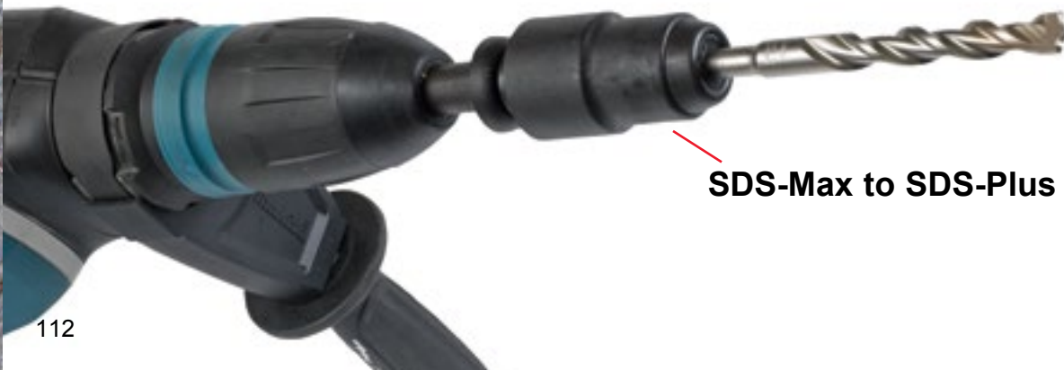
SDS-Max to SDS-Plus Adapter