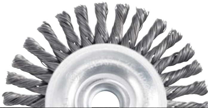
Stringer Bead Wheel