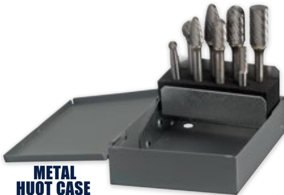
METAL HUOT CASE