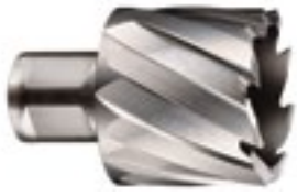
1" Cutting Depth