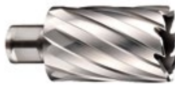
2" Cutting Depth