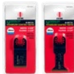
BI-METAL TITANIUM COATED