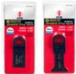
BI-METAL JAPANESE TEETH