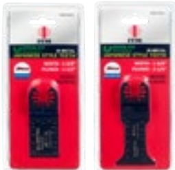
BI-METAL JAPANESE TEETH