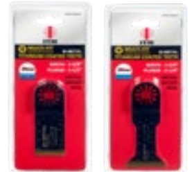
BI-METAL TITANIUM COATED