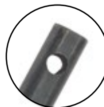
FISH HOLE ON SHANK