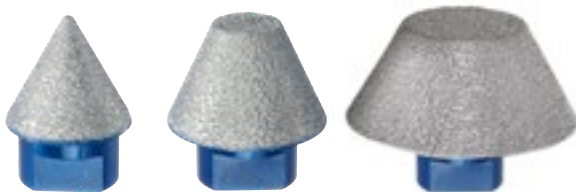
POINT-1 POINT-2 POINT-3